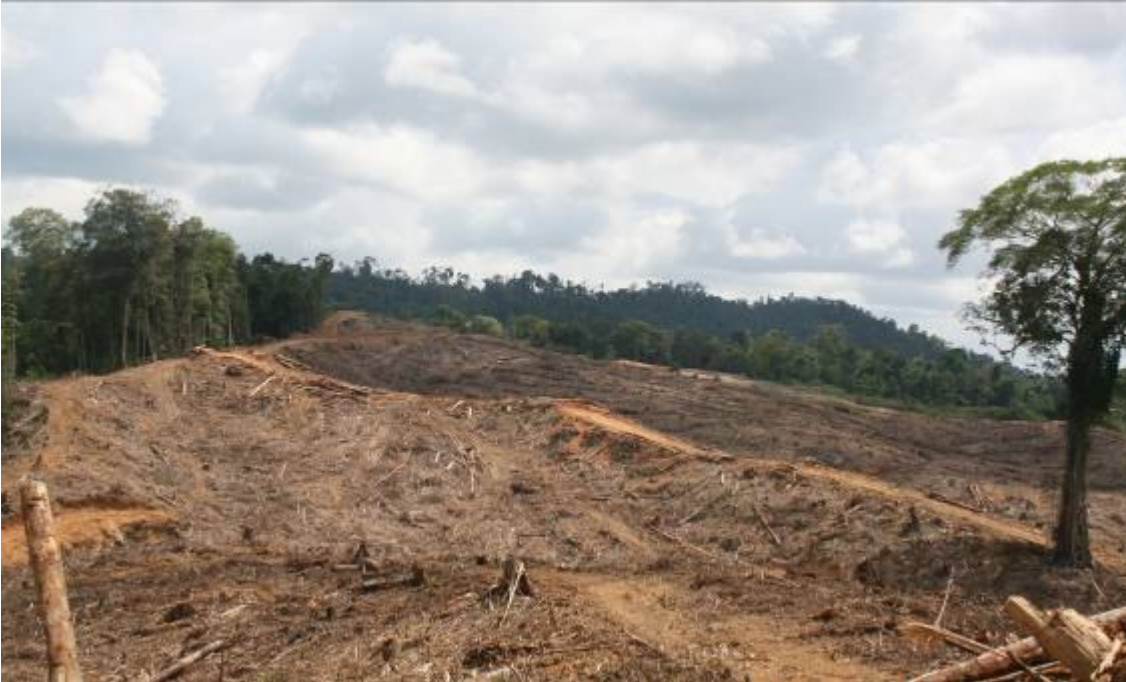
Picture 1. Clearcutting site by PT Rimba Jaya Abadi, contractor of PT Wira Karya Sakti (APP subsidiary), in coordinate point S Latitude 01^{\circ} 22' 14.0'' and E Longitude 102^{\circ} 42' 34.0''