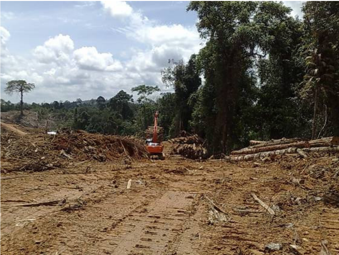
Picture 2. Clearcutting area by PT. Rimba Jaya Abadi, contractor of PT Wira Karya Sakti, in coordinate point S Latitude 01^{\circ} 22' 14.0'' and E Longitude 102^{\circ} 42' 34.0''